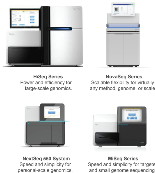
Figure 3: Illumina NGS Sequencing Systems Portfolio —Illumina NGS systems offer solutions for a broad range of applications, sample types, and sequencing scales. Each delivers high-quality data and high accuracy with flexible throughput and simple, streamlined workflows. Data can be seamlessly compared, exchanged, and analyzed in BaseSpace Sequence Hub.

The NextSeq 550 System is easily configured, providing researchers with scalability to handle low to high-throughput project sizes. Based on sample volume and coverage needs, researchers can choose between two flow cell configurations (High-Output and Mid-Output), easily shifting from low- to high-throughput with each sequencing run (Table 1). The NextSeq 550 System provides integrated support for paired-end sequencing, offering user-defined read lengths up to 2 × 150 bp. The system is supported by the full suite of Illumina library preparation and target enrichment solutions, offering library compatibility across the Illumina sequencing portfolio. This allows researchers to easily scale up studies to the higher-throughput HiSeq® and NovaSeq™ Series Systems, or perform follow-up studies on the MiSeq® Series Systems (Figure 3).