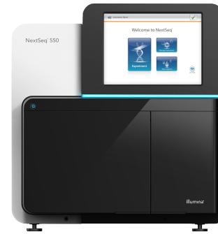
Figure 1: NextSeq 550 System —By leveraging the latest advances in SBS chemistry and user-friendly workflows, the NextSeq 550 System delivers high-quality results for exome, transcriptome, and targeted resequencing applications.

The NextSeq 550 System enables researchers to keep pace with technology, putting them in control of their sequencing and microarray projects. This robust, scalable system turns a broad range of high-throughput applications into affordable everyday research tools. The flexible NextSeq 550 System enables researchers to switch quickly from one application to another, and configure output based on sample volume and coverage needs. Now, even the