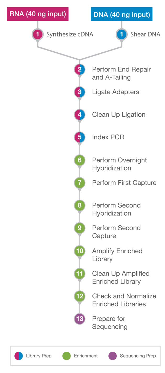
Figure 2: Combined Library Prep Workflow - The DNA and RNA samples follow the same workflow, after the cDNA synthesis step (for RNA) and the shearing step (for DNA).